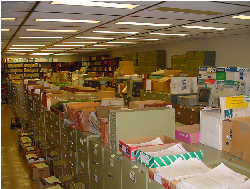
Prior to computerization, the Land Division filed its documents in the manner shown on the left, which depended heavily on manual systems.

Where privately-owned lands or lands owned by other government entities are required by the State for public purposes, the Division is responsible for acquiring these lands through negotiations, donations, condemnations or land exchanges. In addition to maintaining an inventory of all public lands, the Division serves as an office of record and maintains a central repository of government land documents dat-